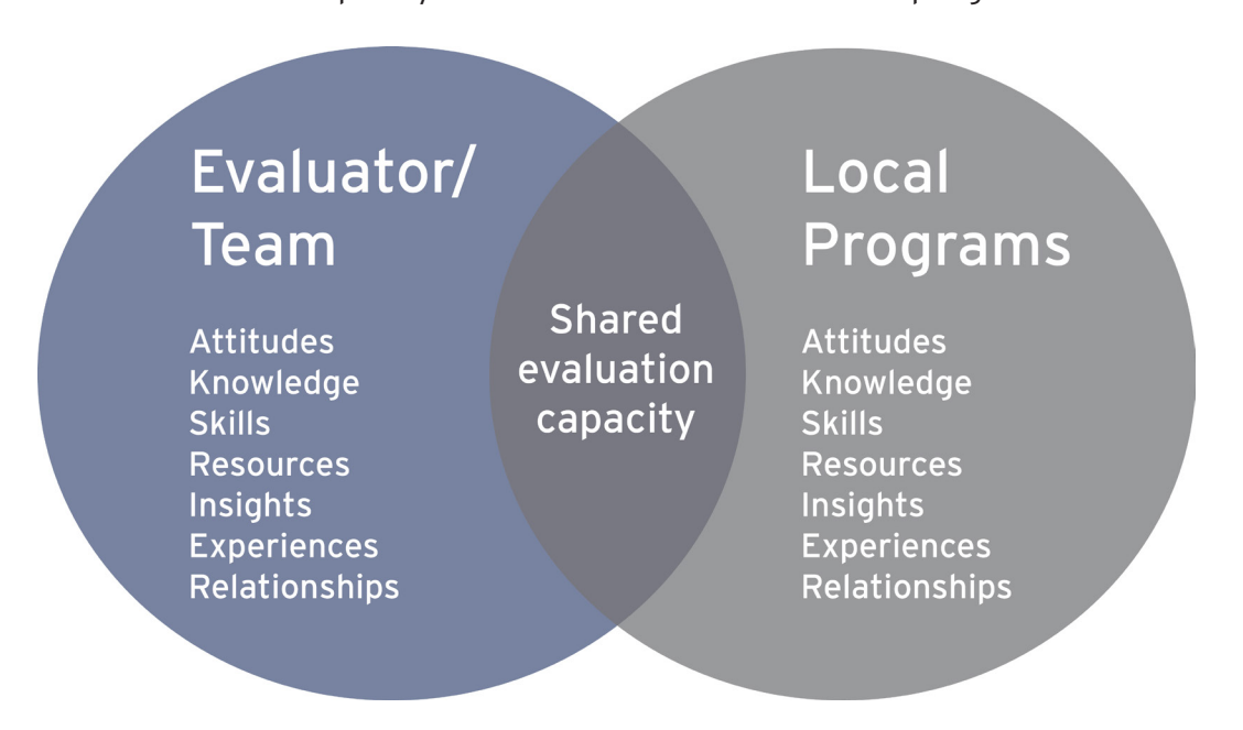
Figure 2. Shared evaluation capacity between evaluators and local programs